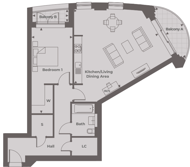
Tre Archi Apartments

Total Internal Area 77.30 sq. mts. 832 sq. ft.