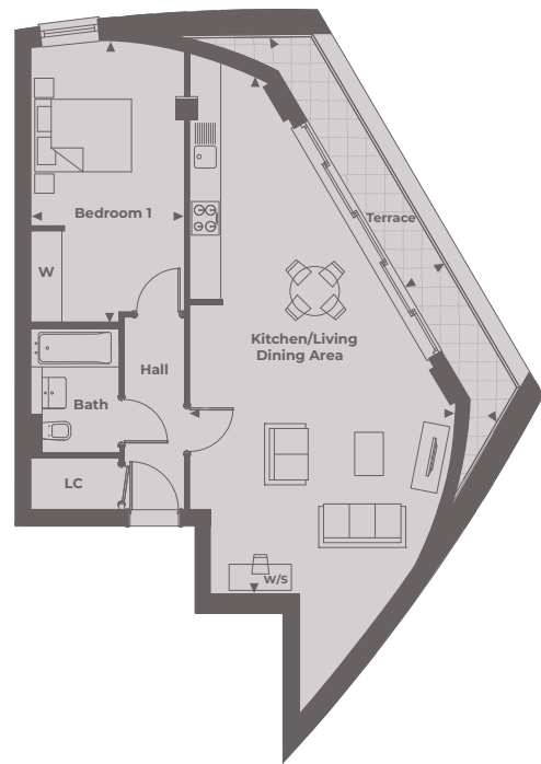
Tre Archi Apartments

Total Internal Area 67.53 sq. mts. 727 sq. ft.