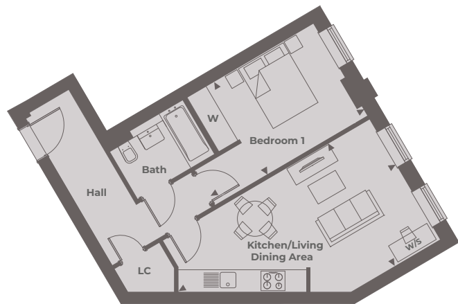
Tre Archi Apartments

Total Internal Area 48.82 sq. mts. 526 sq. ft.